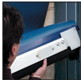
Break-Away tabs are easily reinserted into the side columns