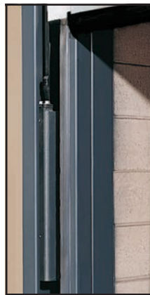
Counterweights within side column assist the motor in opening and closing the door